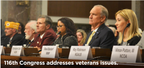
116th Congress addresses veterans issues.

In January 2019, legislators commenced the first session of the 116th Congress with over 100 new members (19 of them veterans) and a new leadership team in the House of Representatives. Democrats will control the House for the first time since 2010, and forecasters predict a steady stream of oversight hearings to examine the executive branch. In the veterans space, expect that focus to fall on implementation of major legislation passed in the 115th Congress including disability appeals reform, electronic health record modernization, higher education, and community care.