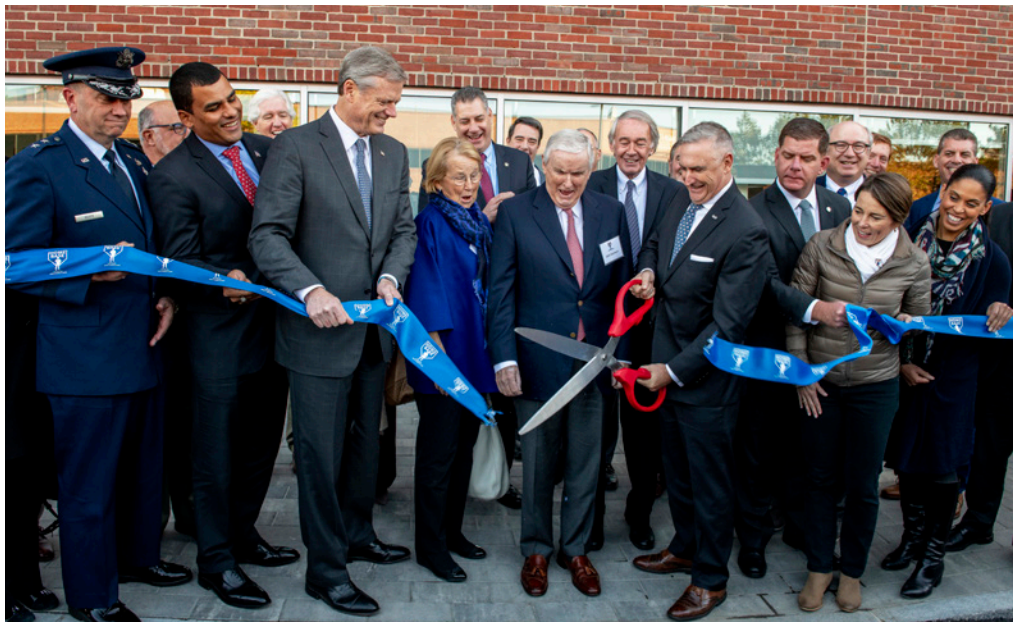
Distinguished guests christen new Home Base headquarters.

Continuing to scale its innovative and effective approach to mental health and brain injury care for veterans, service members, and their families, Home Base, a Red Sox Foundation and Massachusetts General Hospital Program, officially opened the doors to its National Center of Excellence and cut the ceremonial ribbon for its new location in the Charlestown Navy Yard on September 28. This Center will double Home Base's capacity, delivering a broad range of key innovations to its design, providing the space and resources needed to significantly enhance the mental healthcare and support services provided to service members, veterans, and their families dealing with the invisible wounds.